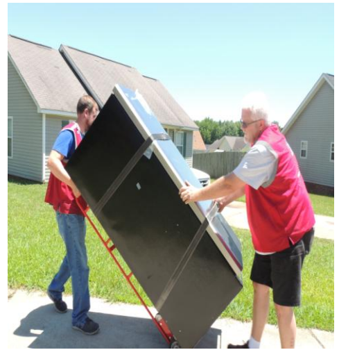
In with the new...A new Energy Star refrigerator being installed by Lowe's employees.